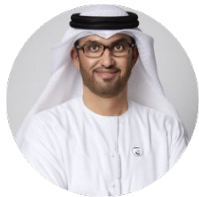
Dr. Sultan Al Jaber COP28 UAE President