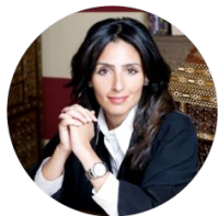
H.E. Razan Al Mubarak High-Level Champion